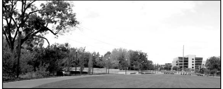
Guadalupe River Park and Gardens

are benches and some areas have places to have picnics and barbecues. You can access the park from just about any road that crosses the Guadalupe from the Discovery Meadow to Hedding Street. There are future plans to link the park to other trails to both the north and the south as part of a larger Bay Area trail system. You can learn more about the park and download a map at www.sjredevelopment.org/grpg.htm